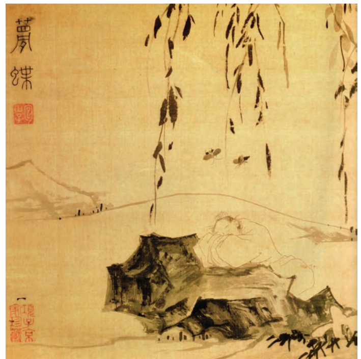
Ming dynasty, mid-16th century Ink on silk